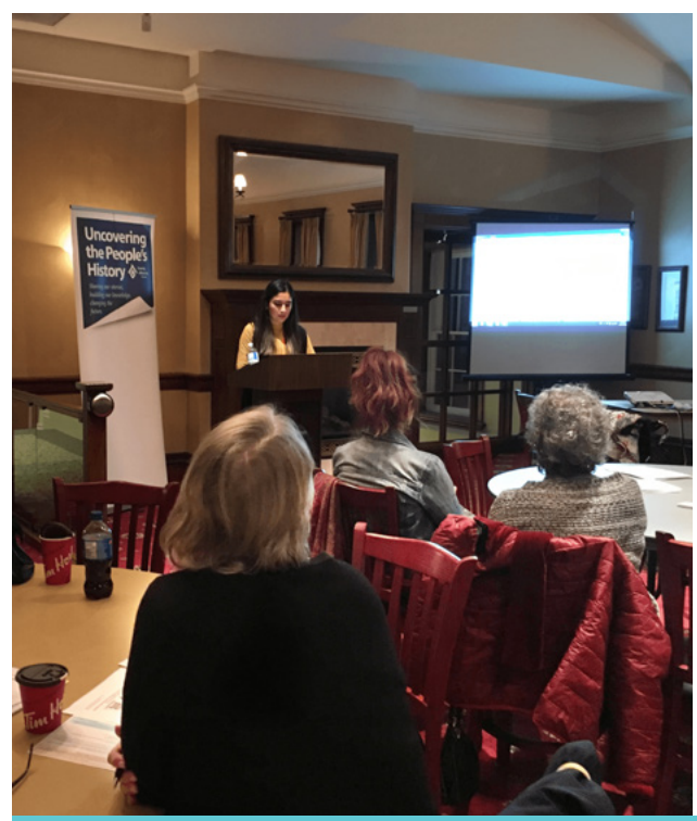
Families from Durham Region and beyond met to hear about Durham Family Network and the Uncovering the People's History project.

Members of Family Alliance Ontario were present to launch Uncovering the People's History, which will be organized in this area by the DFN. The vision of the Uncovering the People's History project is to assist individuals and their families/friends to understand the negative impact that institutionalization has on people, not only the individuals themselves, but their families, and society as a whole. It is important to Family Alliance Ontario to keep the history alive so that the harm inflicted on people through the institutional care model is never forgotten and so that it will never happen again.