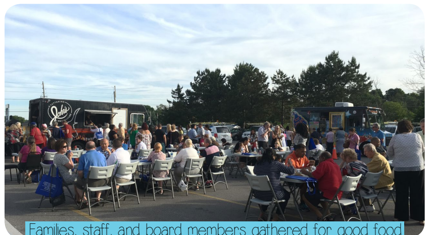
Families, staff, and board members gathered for good food and even better conversation after the business meeting and presentations.

Thank you to everyone who came out to show their support for Durham Association for Family Resources and Support. Being a family-led organization, it was a nice opportunity for families to see others they have not seen in many years, and to meet new families as well. The opportunity for families to connect is one we always see as an investment - and having tasty food trucks around certainly didn't hurt! We hope to see everyone again next year as we meet once again to discuss our work and mission here in Durham Region.