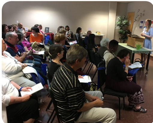
Our official name change highlighted the business meeting agenda

We had a fantastic turnout on Tuesday, June 26th for our Annual General Meeting here in our office. The weather was on our side and those who met were able to mix and mingle the evening away after the business and presentations concluded. A big thank you to our fantastic presenters who shared with us their small business ventures and some of the story behind how they got up and running. We heard from many families afterwards that are now encouraged to move forward with their own ideas and plans around entrepreneurship.